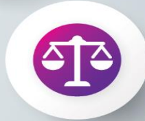
Exhibit Strong Personal Qualities